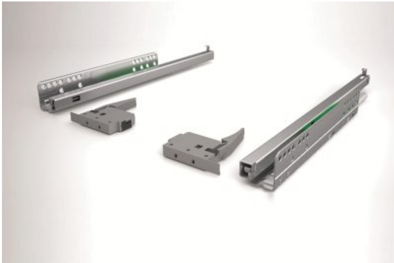
FGV N665H EXCEL RUNNERS